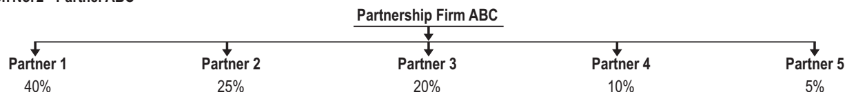
Illustration No. 2 – Partner ABC

For Partnership Firm ABC, Partners 1, 2, 3 and 4 are considered as UBO as each of them holds >=10% of capital. KYC proof of these partners needs to be submitted including shareholding.